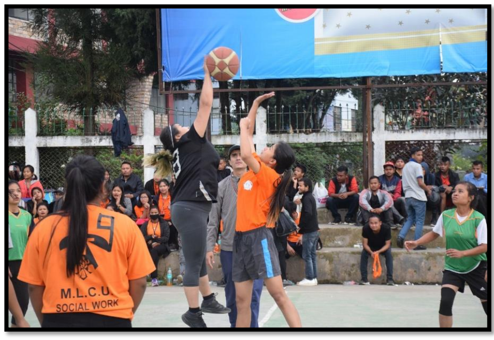
Students in action during Aurora 2018