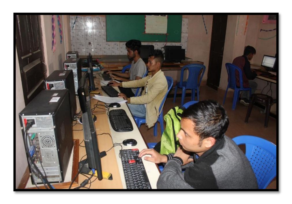
Students participating in an activity as part of Department of Computer Science's celebration of 'Metanoia 2019'