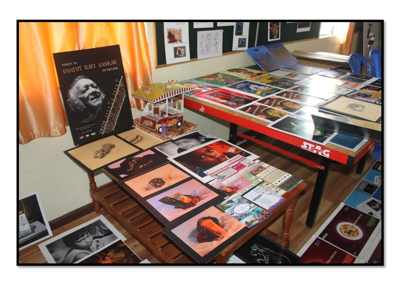
Art Exhibition organised in collaboration with Swar Sangam, Kolkatta