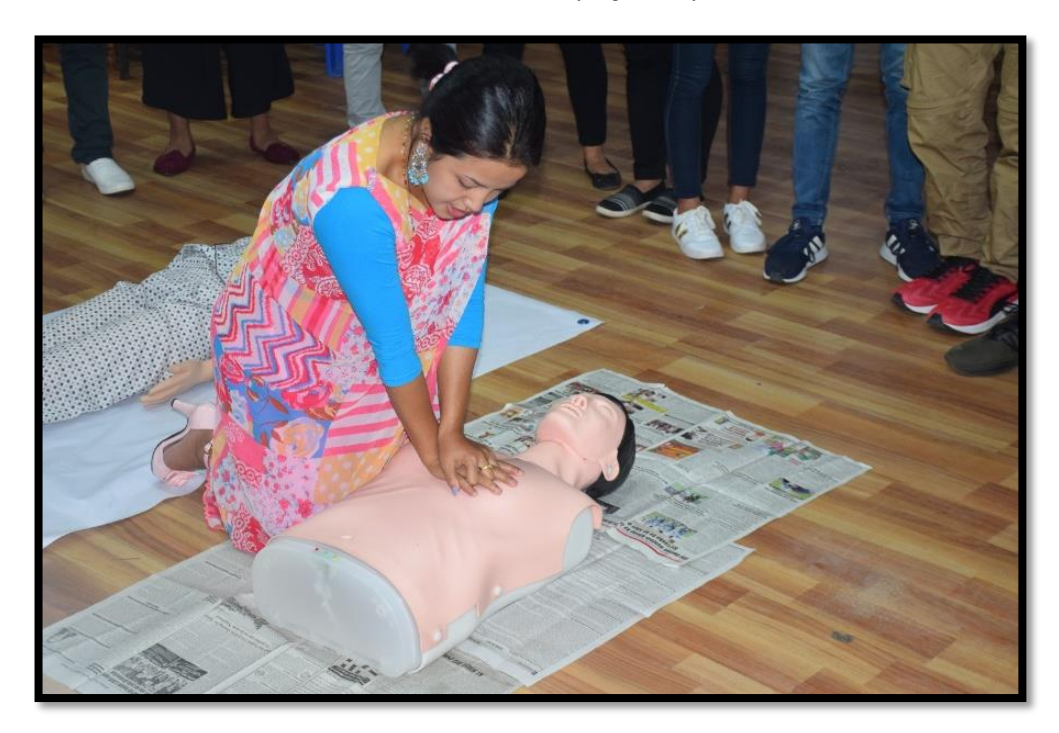
First Aid Workshop for students and faculty