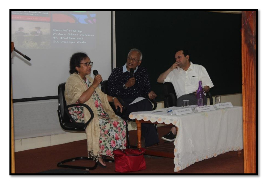
Panel Discussion during World Book Day Celebratio