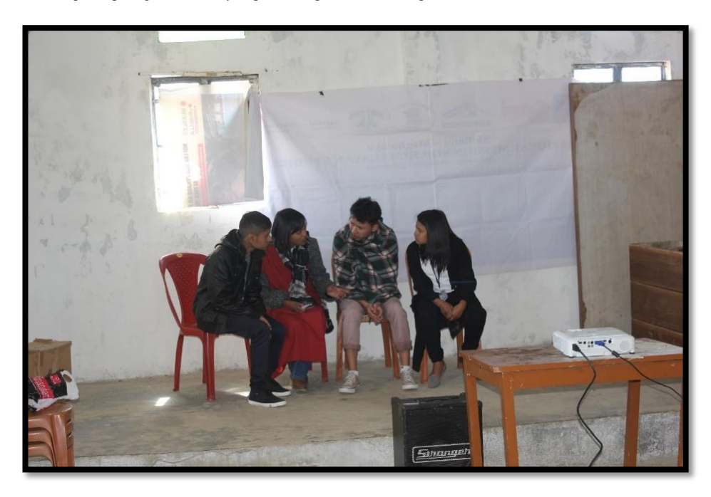
Awareness\ programme\ organised\ by\ the\ Department\ of\ Environment\ and\ Traditional\ Ecosystems\ at\ Mawkhma.