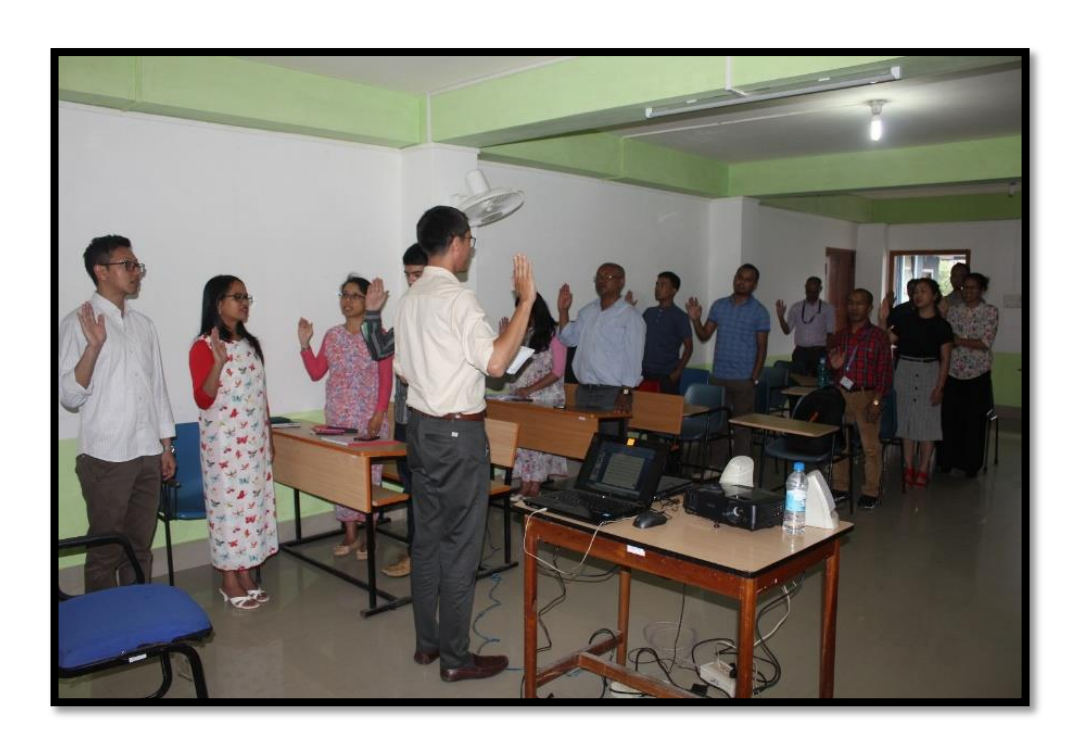
Observance of World No Tobacco Day organised by NSS, MLCU.