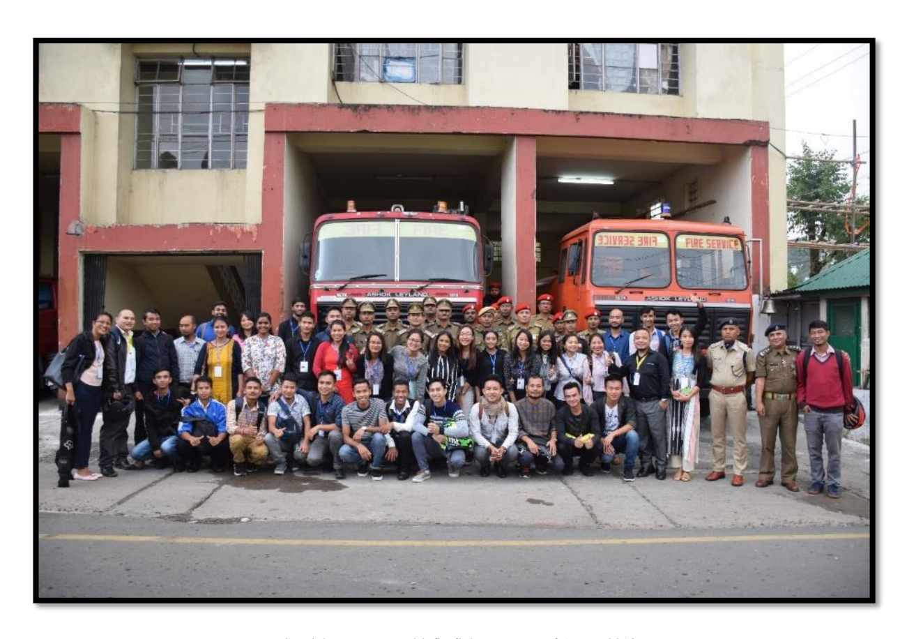
Special programme with firefighters as part of Aurora 2018