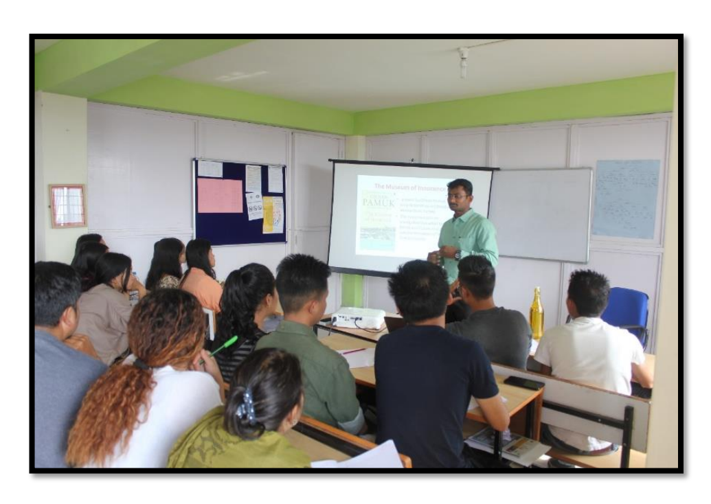
Department of English and Communication's interactive session.