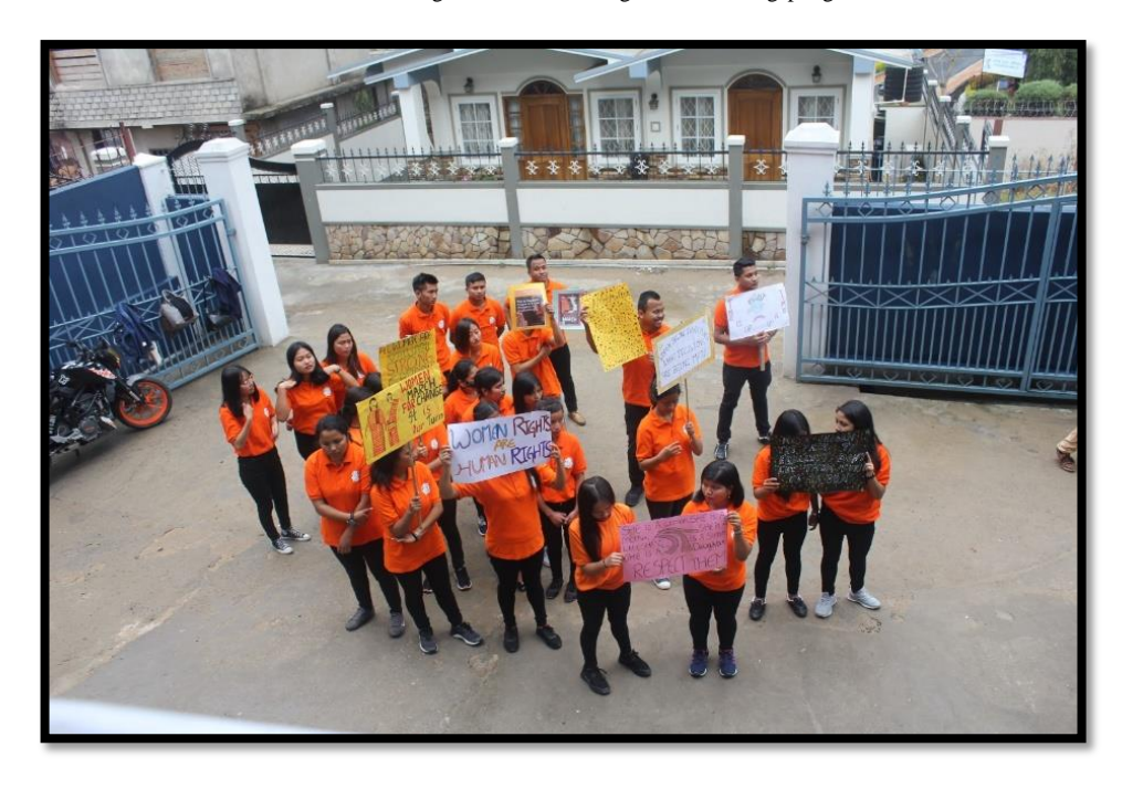
The Department of Social Work joining the rest of the nation in the 'March for Change.'