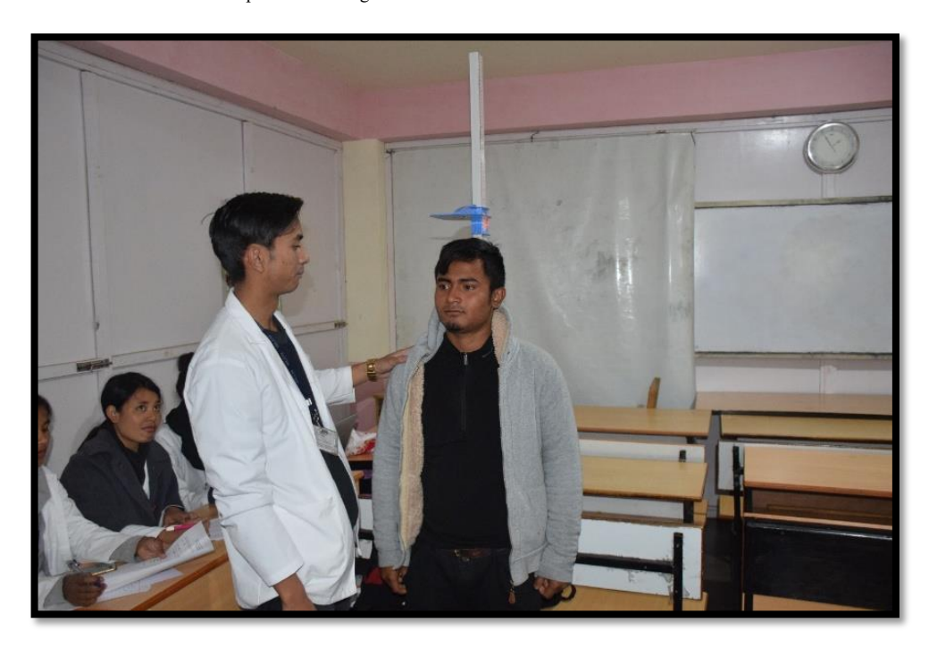
Health screening for the students of the University.