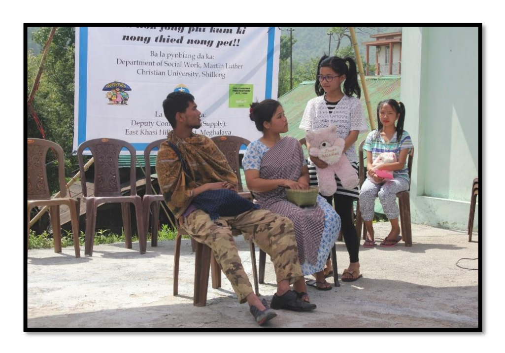
Consumer Rights Awareness Programme at Nongspung