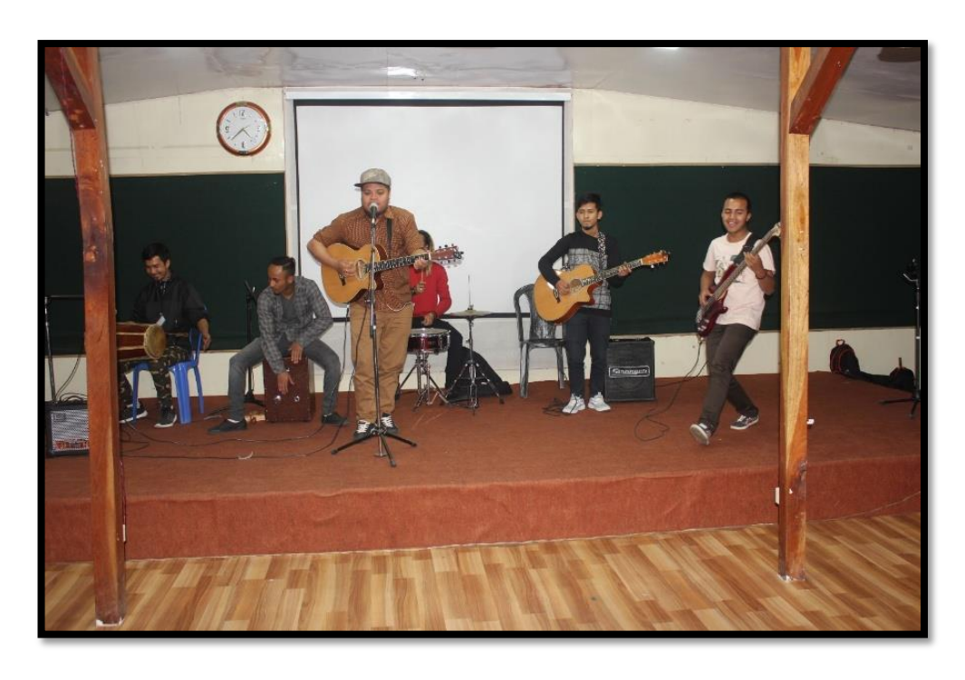
One of the many musical performances by the students of the Department of Music.