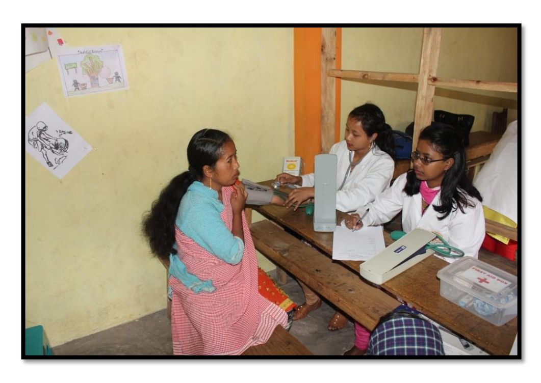
Health Camp at Mawliehpoh organised by the Department of Allied Health Sciences.