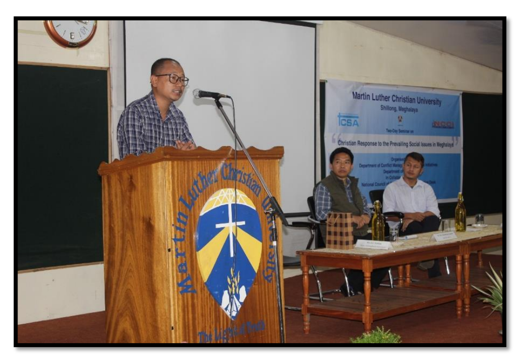
Seminar on "Christian response to prevailing Social Ills" organised jointly by the Department of Theology and Department of Conflict Management and Peace Initiatives.